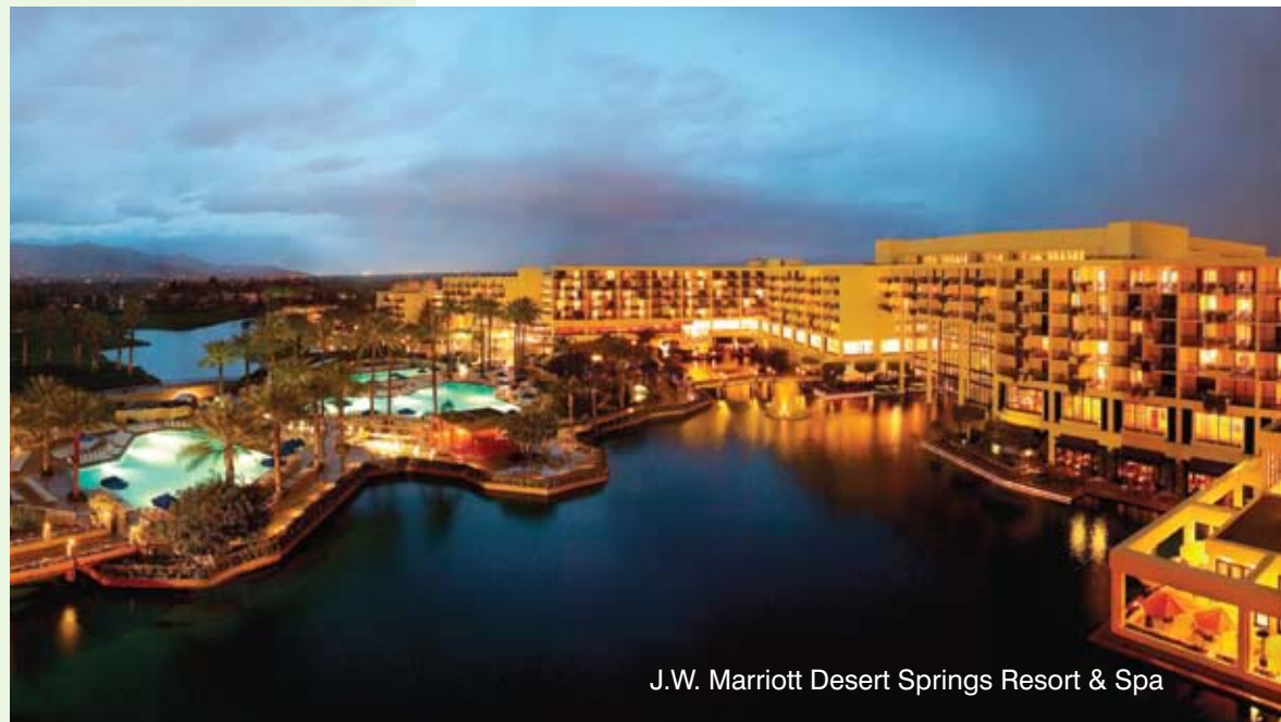
J.W. Marriott Desert Springs Resort & Spa